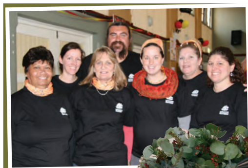
ORIC staff volunteering at the Ngunnawal Aboriginal Corporation

As part of ORIC's volunteer opportunities program seven staff from the Canberra office volunteered their time and skills to help out Ngunnawal Aboriginal Corporation at its NAIDOC event in Yass on Tuesday 9 July. Staff set up tables and chairs, decorated the hall and helped to serve lunch.