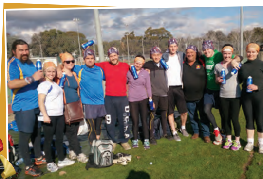
ORIC staff during NAIDOC week

* National Aboriginal and Islander Day Observance Committee.