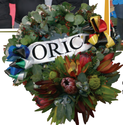
ORIC wreath laid at the War Memorial